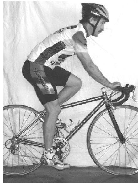
Crank arm facing camera at 6:00, hands on tops.